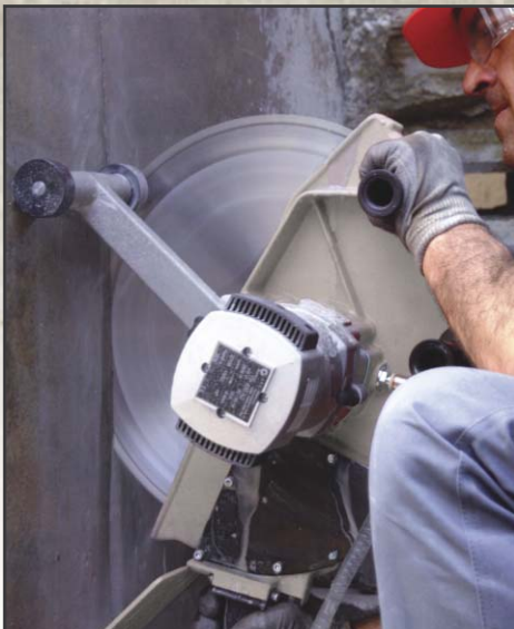
MAX CUTTING DEPTH 6"