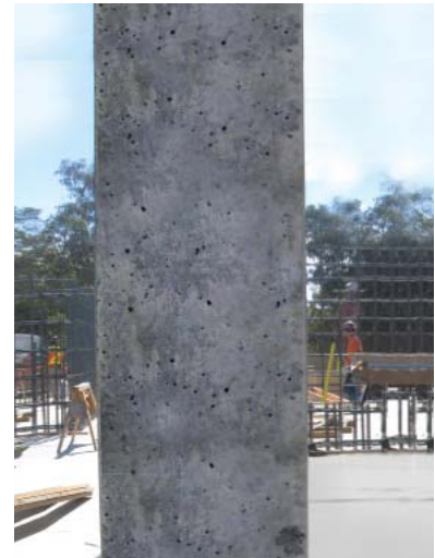
Results from standard industry vibrator over speeding