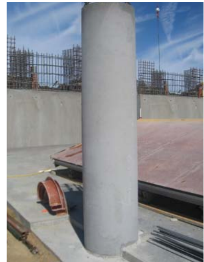
Results with Sure Speed controlled speed vibration

Sure Speed's unique design controls vibrator speed and lowers the amount of concrete bleeding, reduces harmful loss of air entrainment, and concrete segregation due to over vibrating. Sure Speed allows the operator to be in control of the process by eliminating the speed variations inherent with existing vibrators affected by motor size, head size, and shaft length.